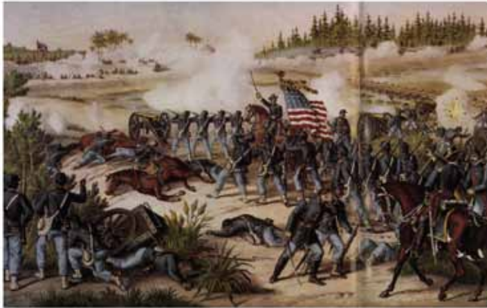
Battle for Olustee