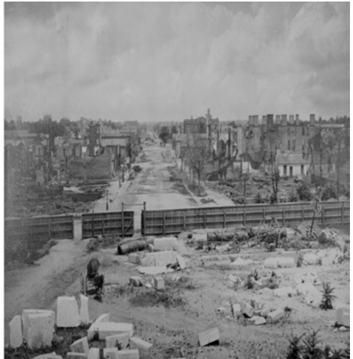
Columbia SC - February 15-17, 1865

Run VA. Feb 6 Lee named Commander of Confederate Armies. Feb 17 Federals capture Columbia SC, city in