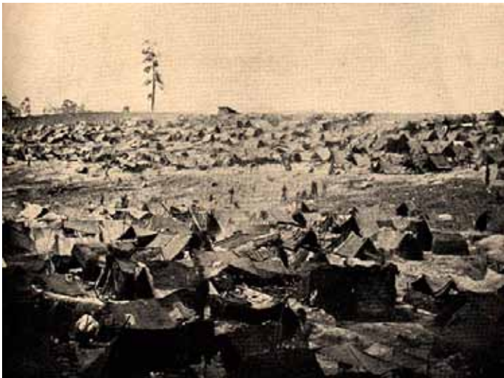
Andersonville Prison Camp, Americus GA

Bragg named chief of staff for Armies of the Confederacy despite his conflicts with other generals. Feb 27 Federal prisoners begin arriving at camp near Americus GA - Later known