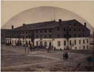
Libby Prison - Richmond VA