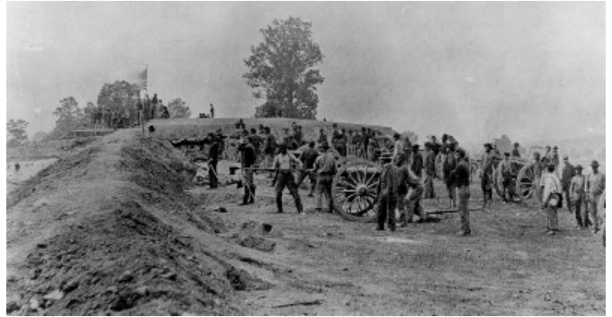
Hatcher's Run - Confederate Battery

1865 - Feb 1 Carolina Campaign in full Operation/Sherman begins march into SC. Feb 3 Hampton Roads Conference between Lincoln and Seward/Alexander Stephens, John Campbell, R M Hunter. Feb 5 - 7 Battle of Hatcher's